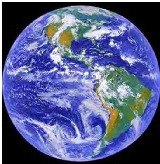
Figure 1 Two-thirds of Earth's surface covered with water

Introduction: It is very known that water plays an important role on our Earth and as we know without water, life would cease to exist. While Earth has an abundant reservoir of water, covering three-fourths of its surface, freshwater is a merely 2.6% of the total water. Water is said to be a renewable resource but the rate at which humans and animals are using water, fresh water might be a scarce resource in the recent future. Our body is also made up of 70% water and we use water for a number of reasons from cooking to cleaning and of course drinking it. A lot of experts predict that the next World War will be fought over water!