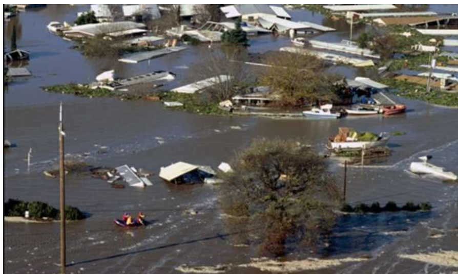
Figure 3 Floods posing danger to property and life

Intensity and duration of rain vary in different regions across the country. While rainfall is very important for irrigation and the continuous availability of water, excess rainfall can pose a number of problems. Due to excess rainfall, the water level of rivers and oceans rises which can potentially spread and submerge nearby cities and villages which poses a grave danger to both life and property. These are known as floods.