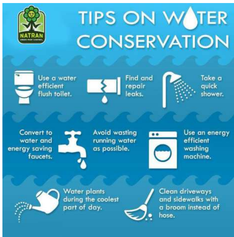
Figure 5 A few tips to help save water