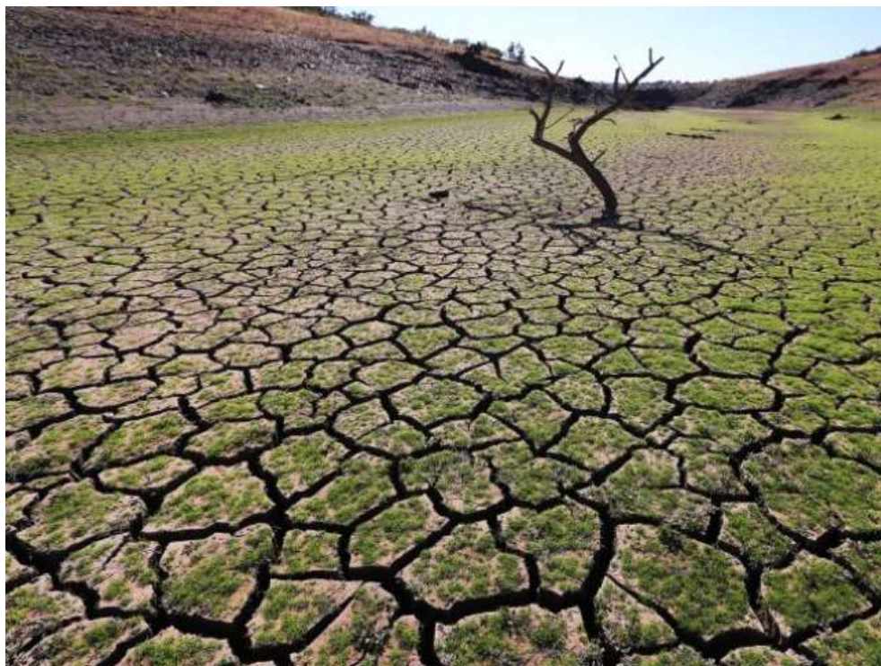
Figure 4 Dried fields as a result of droughts